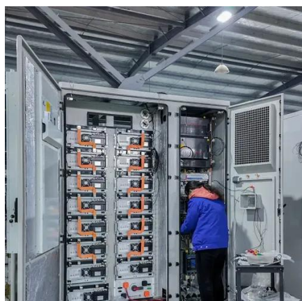
OASIS 60 Battery Cabinet: Scalable Energy Storage for Businesses

All-in-one, pre-assembled, scalable, battery energy storage system designed for commercial and industrial applications. All-in-one cabinet - battery, inverter, cooling, and EMS