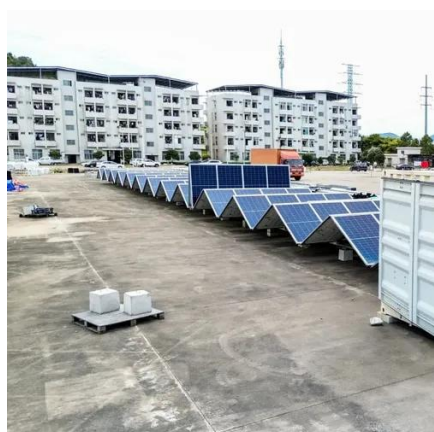
60 kVA Battery Storage , Energy Storage System , Aggreko US

Deye GE-FL60 cabinets, 60kwh battery bank with IP65 enclosure, cooling and fire suppression system. Deye's GE-FL60 are advanced lithium iron phosphate (LFP) battery energy storage systems ...