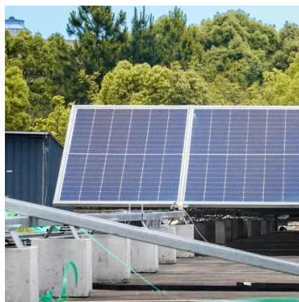
Large-Scale energy storage , Microgreen.ca

Suitable for inverter voltage ranging 600 to 1500 volts, allowing for multiple applications. Adaptability to ambient temperature range of -30°C to +55°C. Resistance up to C5 corrosion level with 20-yr ...