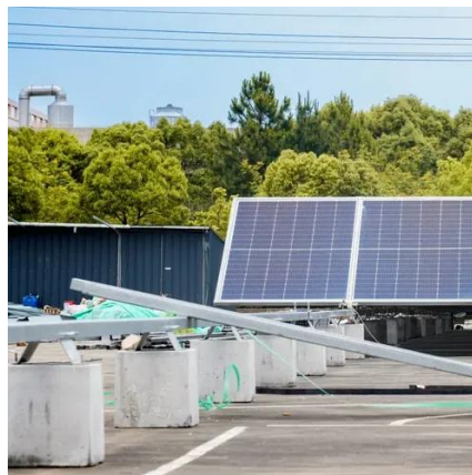
Utility-Scale PV , Electricity , 2024 , ATB , NLR

Capacity is not the same as electricity generation. Power plants have a capacity to produce a certain amount of power during a given time, but if they are taken offline (i.e. for ...